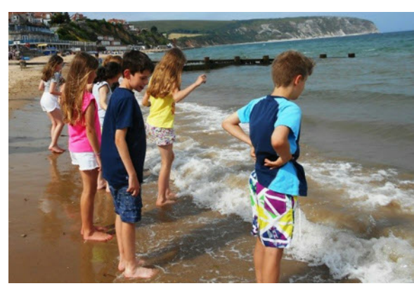
Swanage Residential Trip

The children have enjoyed taking part in a wide variety of sports. Recently the Year 5/6 Quadkid Athletics team were victorious at Kineton High School and the younger team also did well and came third in their competition. In addition, the rounders' team played well in their tournament with eight local schools. Tysoe were competitive and keen, and only lost out on a place in the final by half a rounder! We enjoyed the exciting build-up to the Aviva Women's Cycle Tour as it went through the village. The race itself passed in a flash but the speed and technique of the women riders was inspiring.