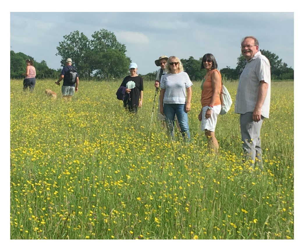
Walking through a beautiful buttercup field on the Village Walk June 9th