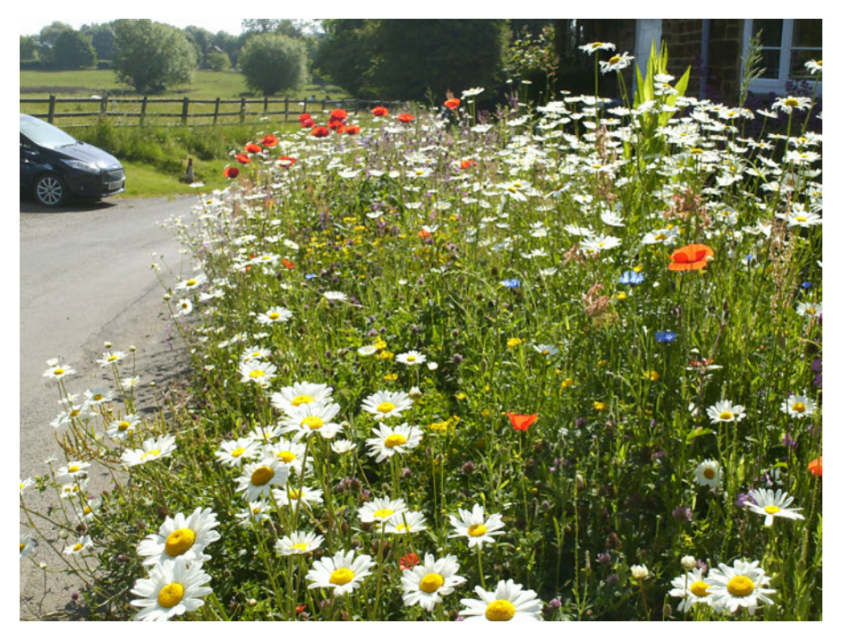
Flowers along the verge on Beech Road