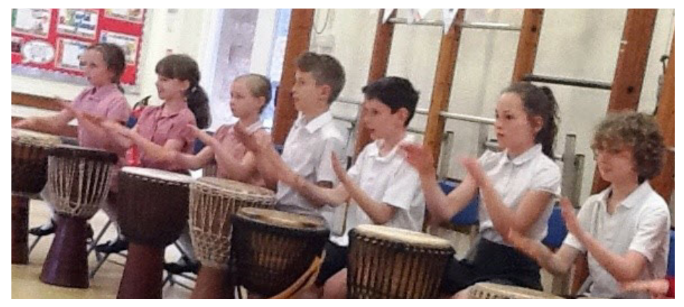
Good rhythm on Djembe Drums

The children have enjoyed taking part in a wide variety of sports. Recently the Year 5/6 Quadkid Athletics team were victorious at Kineton High School and the younger team also did well and came third in their competition. In addition, the rounders' team played well in their tournament with eight local schools. Tysoe were competitive and keen, and only lost out on a place in the final by half a rounder! We enjoyed the exciting build-up to the Aviva Women's Cycle Tour as it went through the village. The race itself passed in a flash but the speed and technique of the women riders was inspiring.